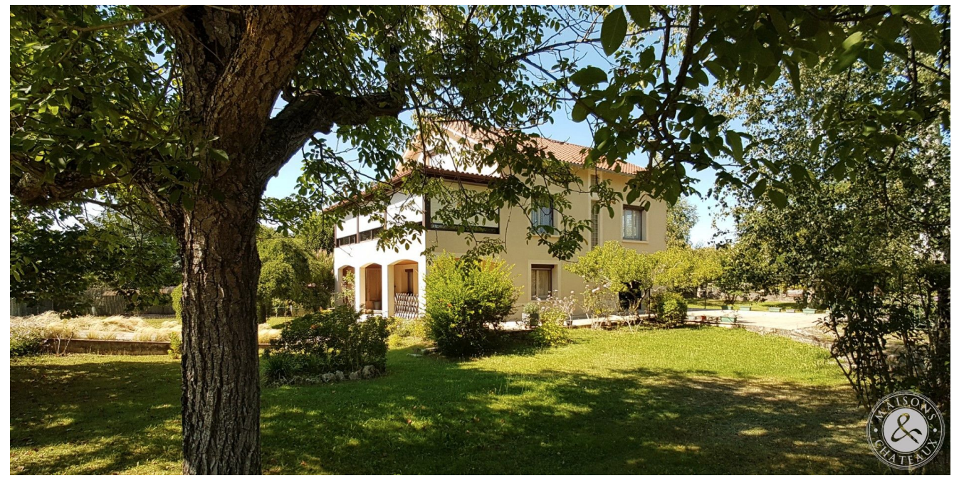
Ref : 9723LRC